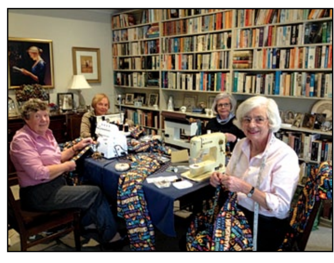
Christchurch AAW members at work sewing the NZ Army Laundry bags.

Earlier this year, the New Zealand Association of Anglican Women received a request from the New Zealand Army to supply 110 laundry bags for the NZ soldiers based overseas. The Australian soldiers based overseas have green and vellow coloured laundry bags and the NZ Army would like some new laundry bags for the NZ soldiers.